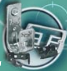
Spring Steel Fasteners