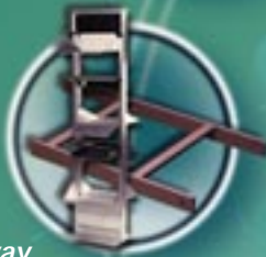
Cable Runway & Relay Racks