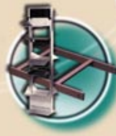
Cable Runway & Relay Racks