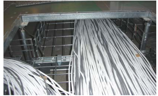
Cables installed in a raised floor.

The most common type of cable support found in data centers is wire basket cable tray. Wire basket is sturdy enough to support large cable quantities, and its open structure provides adequate cable ventilation and does not block airflow. Per the ANSI/TIA/EIA-942 standard, cable tray should have a maximum depth of 150 mm (6 in). Deeper cable trays can adversely affect manageability and administration of cables. If more than 6" (150mm) of cable depth is required, trays should be installed in multiple layers to provide additional capacity. Since many data centers do not start at full capacity, cable tray systems are frequently designed to accommodate growth. Often the initial installation is a single layer, and further layers of cable tray are installed as the data center infrastructure grows. If the initial cables will not be accessed after installation, a complete cable tray structure may be installed over the initial structure. If regular access to the initial cables is required, a cantilever system should be installed. Designers should keep in mind that the NEC requires the removal of cables not currently in use and access to the base structure may be required. See ANSI/TIA-569-B for further cable tray design considerations.