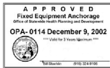
OSHPD Pre-Approval Stamp

On November 1, 2002, OSHPD adopted the 2001 California Building Code (CBC). This code change required OSHPD to differentiate between projects submitted before and after this date. As a result, previously approved manufactured systems were reviewed by OSHPD to determine whether they complied with the new building code. Those manufacturers that met the requirements of the 2001 CBC were given the new OPA number to replace their old R number. B-Line's OSHPD pre-approval number went from R-0114 to OPA-0114 . This OPA number is referenced on the OSHPD engineering stamp, which was placed on each page of the SRS-02 Seismic Restraints Catalog verifying B-Line's compliance to OSHPD's requirements.